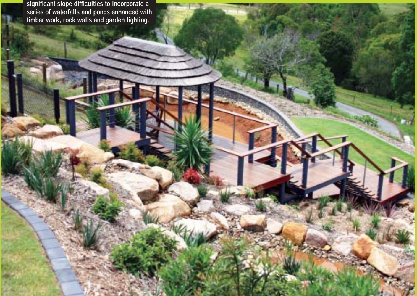
RESIDENTIAL B CATEGORY EQUAL WINNER Wayne Giebel Landscapes – overcame significant slope difficulties to incorporate a series of waterfalls and ponds enhanced with timber work, rock walls and garden lighting.