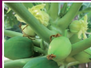
FRUIT & VEG – for small gardens