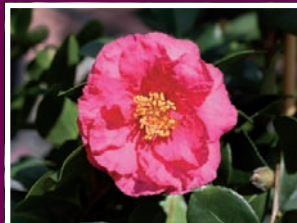
FEATURE – camellias