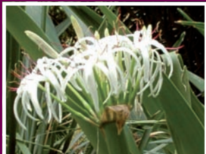
GARDENS – resilient plants