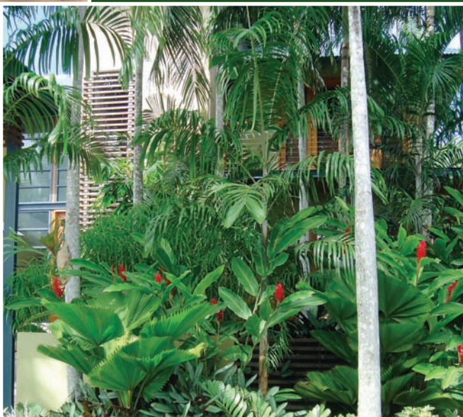
A simple stand of Carpentaria palms ( Carpentaria acuminata ) shelter the west face of this residence.