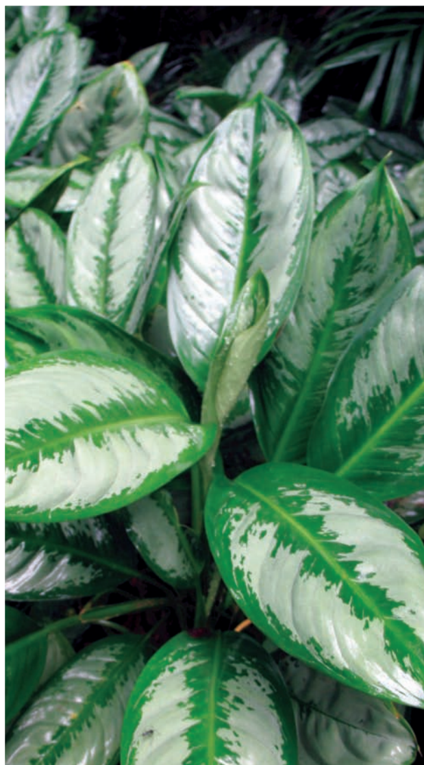
Foliage plants prefer a fertiliser higher in nitrogen.

- nitrogen being responsible for green leafy growth, phosphorus for root development and flower initiation, as well as issues relating to the reproductive parts of the plant. Potassium plays an important role in providing the plant with stronger cells, thereby imparting a measure of disease resistance and vigour, whilst also improving the quality and colour of flowers and fruit.