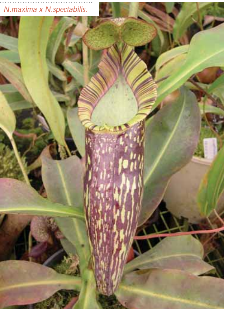
N. maxima x N. spectabilis .

Even the pitchers are a fascinating study, with everything from nectar producing glands around the peristome (pitcher rim), strong UV contrast patterning, scent production, microscopic wax plates, and digestive glands. The pitcher fluid is highly acidic, with some recorded with a pH of 1.9, and is also thought to contain wetting agents which make escape harder. Nepenthes form two types of pitchers, low or terrestrial pitchers are usually large, colourful and squat in appearance, whereas upper or aerial pitchers are usually narrower and trumpet shaped.