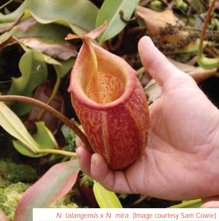
N. talangensis x N. mira .

The pitchers of Nepenthes are wide and varied in size, colour and form. Nepenthes species such as N. truncata and N. merrilliana readily have pitchers up to 50cm in length. Nepenthes albomarginata has pitchers that range from black or dark red, through to pure green. Nepenthes ampullaria is known for its squat pitchers that are almost round.