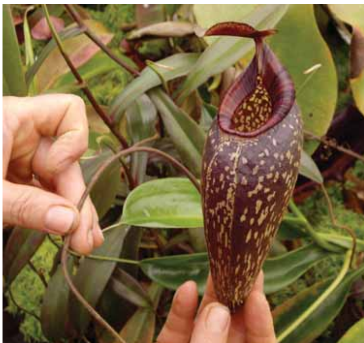
N. spectabilis x N. aristolochioides .