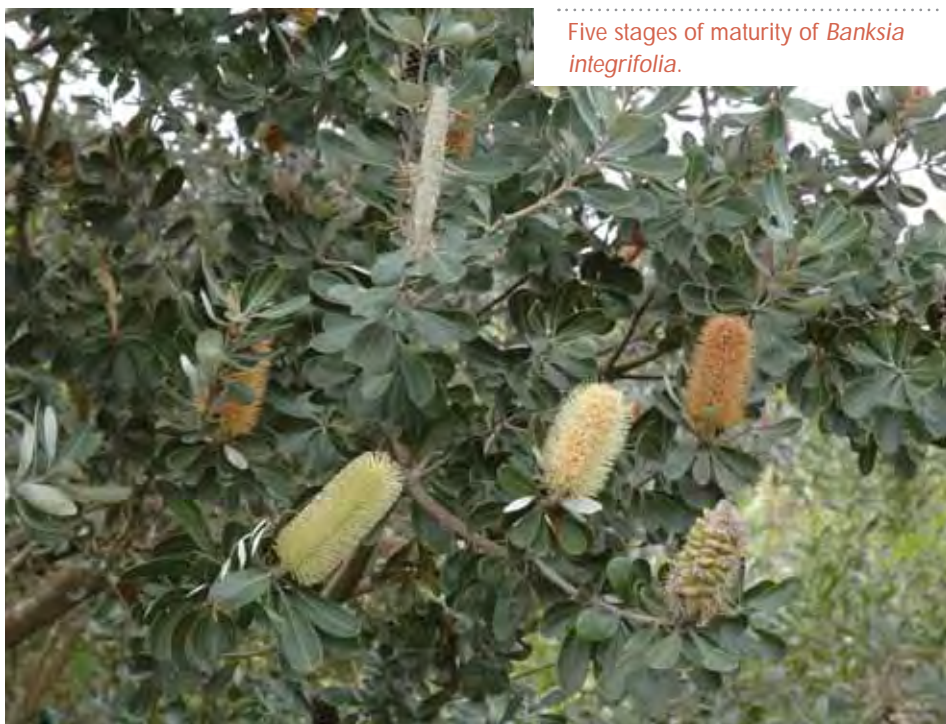
Five stages of maturity of Banksia integrifolia .

effectively lighting up the tree or shrub with their yellow 'candles'. Banksia spinulosa var. collina is even known as 'Golden Candlesticks'. These flower spikes are rich golden yellow with hook-shaped styles a contrasting darker colour. Spikes of all species progressively change to brown and finally grey as they age. Old spikes, particularly those with mature woody fruit, or follicles, are a feature of several species and may remain on the plant for several years as the seed ripens. Banksia aemula has particularly large follicles which protrude from the old grey whiskery stamens.