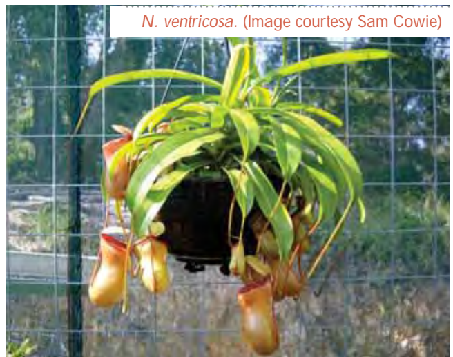
N. ventricosa .