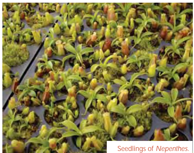
Seedlings of Nepenthes .