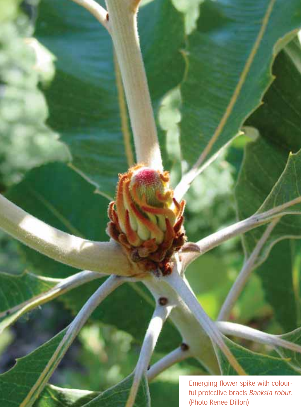
Emerging flower spike with colourful protective bracts Banksia robur .