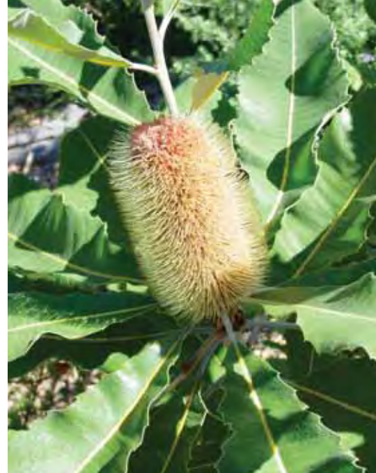
Mature flower spike Banksia robur .