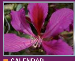
CALENDARAug / Sep / Oct