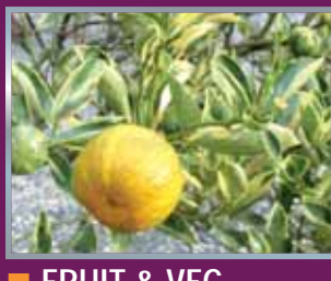
FRUIT & VEG – for this climate