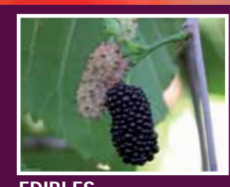
EDIBLES - rocket + mulberries