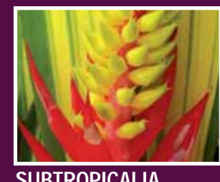
SUBTROPICALIA - bromeliads + gingers